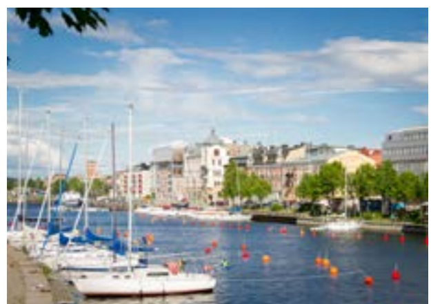
The city of Härnösand in the world heritage site High Coast of Sweden (one of UNESCO's World Heritage Sites), sea, forest and mountains join together and make up for impressive views

Härnösand, aiming at a climate where people are in balance with the environment by 2045. One of several approaches to the Härnösand municipality's environmental and sustainability efforts is to create conditions for reducing climate impact from food consumption which this network can contribute to.