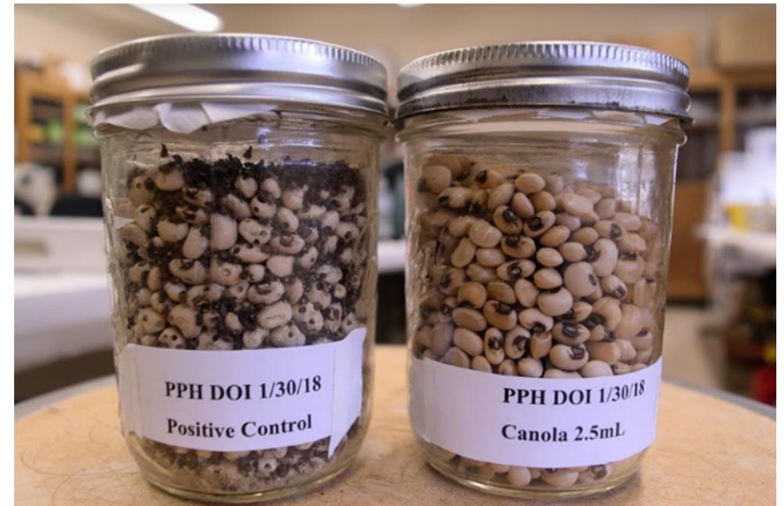
Figure 4. Cowpea variety Pinkey Purple Hull without oil (left) after 6 months of storage. No damage or emerged adults on cowpea treated with canola oil (right).