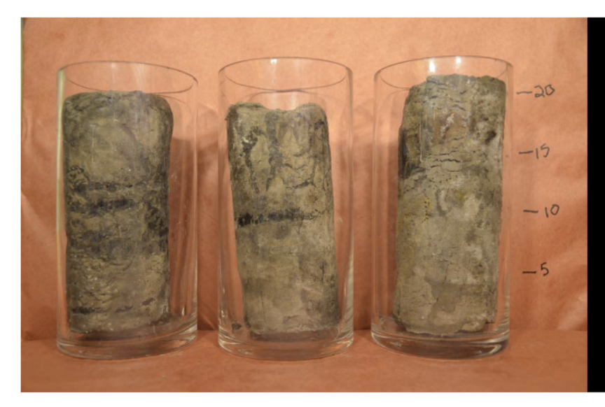
Figure 1: Three ground cores with varying ice contents before thaw, from left to right, high, medium, and low ground ice contents, respectively. Ice lenses are visible in the cores with medium and high ground ice content.