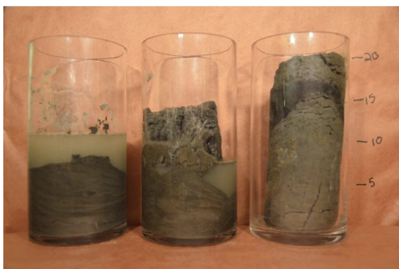
Figure 2: The three ground ice cores in Figure 1 after 12 hours of thawing. The high-ground-ice content core on the left completely collapsed to water and sediment. The medium ground ice core in the middle partially collapsed, with some excess water and sediment, and about half the core is still intact. The low-ground ice core on the right is still structurally intact.