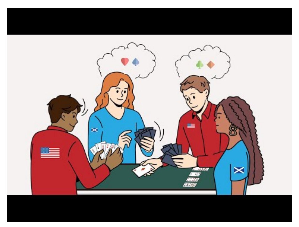
Watch Video At: https://youtu.be/LrPTGNxeKH8

The BAMSA campaign received the endorsement of international bridge organisations such as the <u>World Bridge Federation</u>, the <u>American Contract Bridge League Educational Foundation</u>, and the <u>European Bridge League</u>. It led to the formation of a network of research associates, bridge stakeholders, and policymakers from all over the world. To date, BAMSA's work has resulted in the development of <u>eight major research projects</u>, driven by one key goal: to ensure that everyone can benefit from learning and playing bridge and that this fascinating game will continue to thrive.