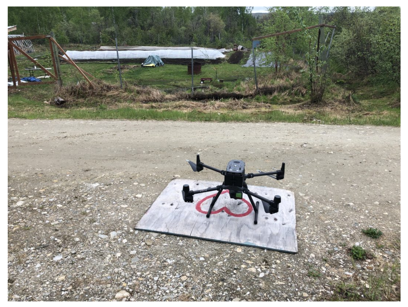
Permafrost Grown's project UAV, a DGI Matrice 3000 with a LiDAR camera, prepares to take off for a survey at a farm site in Fairbanks, AK.